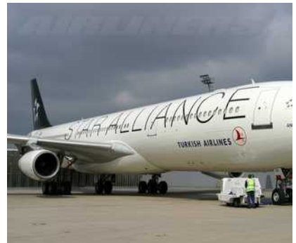
Planes Ground Units

3kVA * 6kVA *10kVA *20kVA *30kVA *40kVA *60kVA *80kVA *100kVA *120kVA *160kVA *200kVA *250kVA *300kVA *400kVA *500kVA *600kVA *800kVA