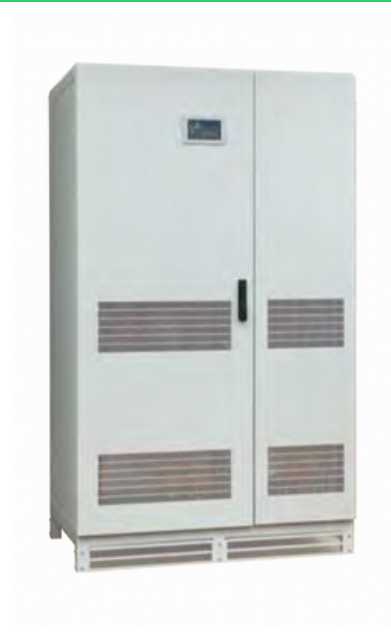
60 kVA - 80kVA / 400V - 208V Frequency Converter

*3kVA * 6kVA *10kVA *20kVA *30kVA *40kVA *60kVA *80kVA *100kVA *120kVA *160kVA *200kVA *250kVA *300kVA *400kVA *500kVA *600kVA *800kVA